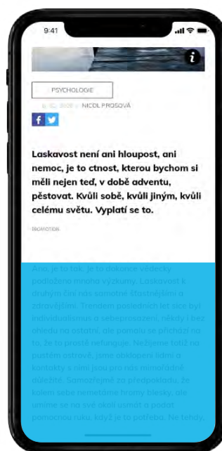
INTERSCROLLER MOBILE RECTANGLE